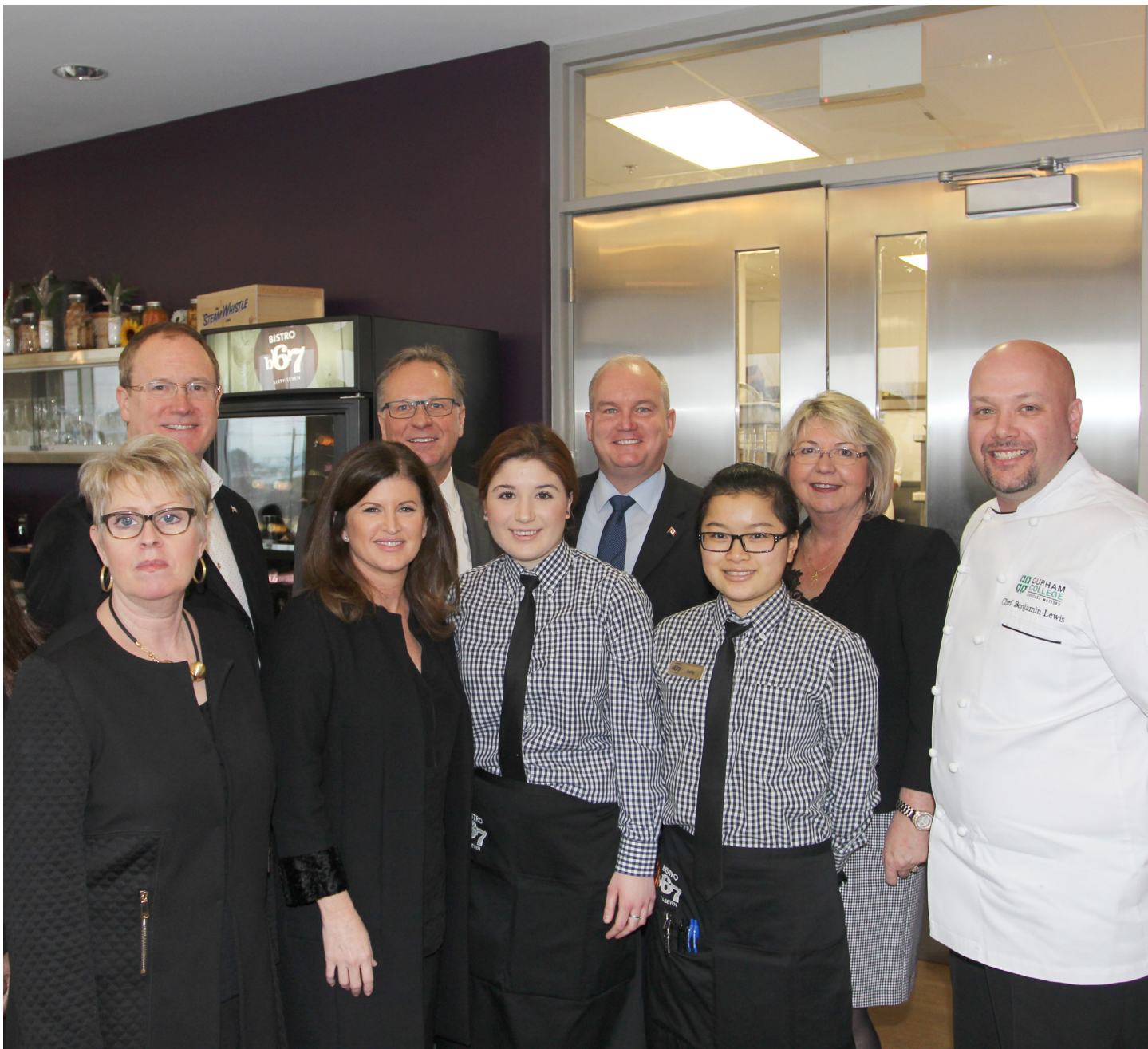
Rona Ambrose, Federal Health Minister, visited Durham College to learn about its emphasis on practical learning opportunities across all our health programs, and showed great interest in how culinary students are trained in healthy meal preparation.