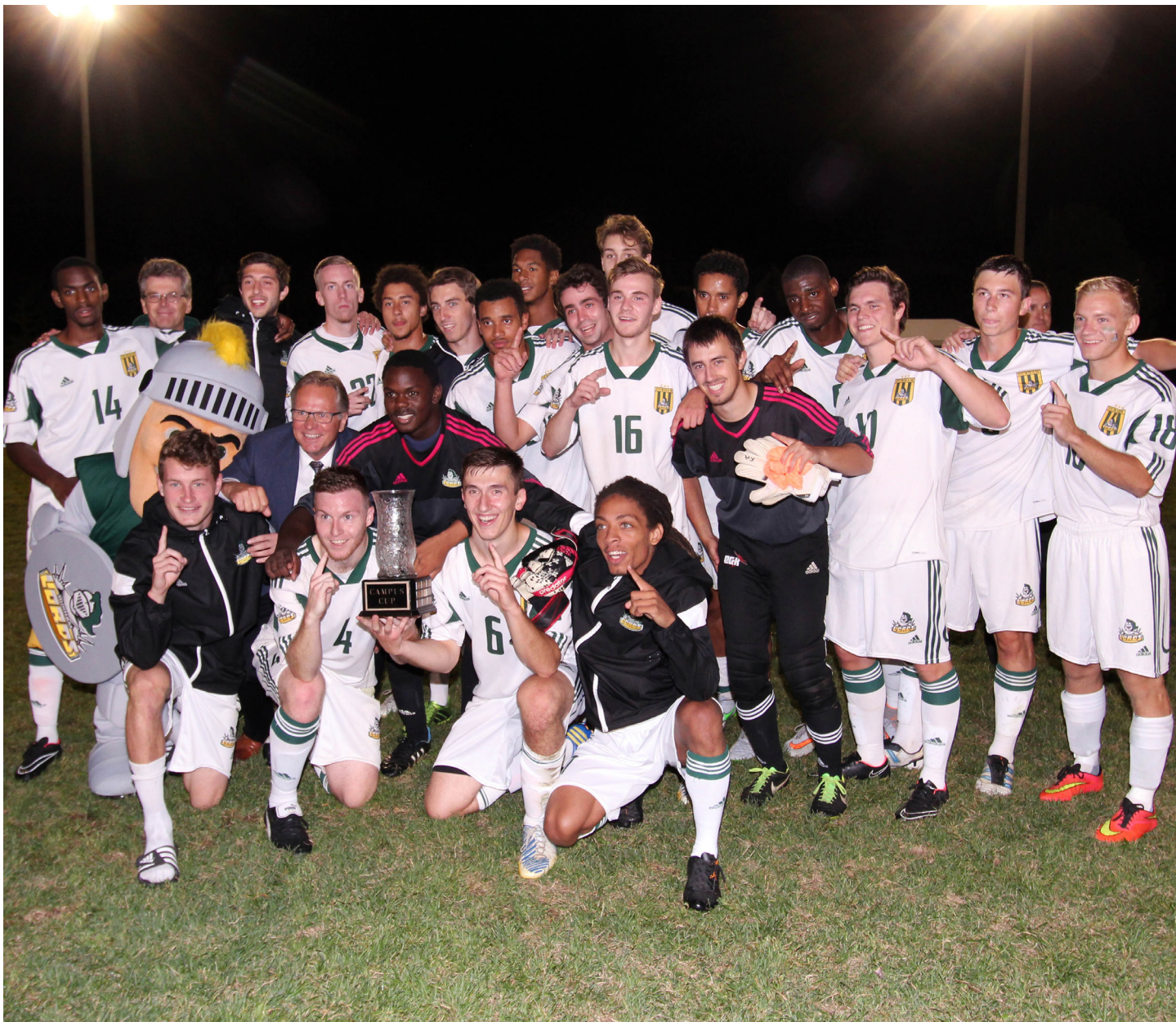
The Durham Lords men's soccer team celebrates their 2015 Campus Cup victory over the UOIT Ridgebacks on September 9.