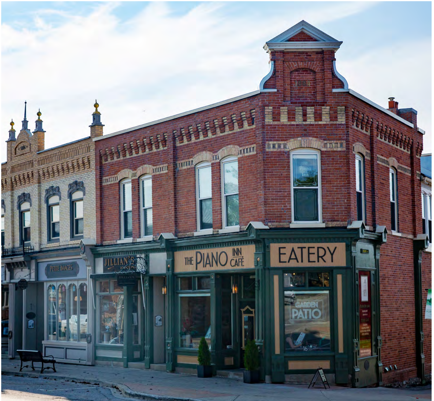
The Piano Inn and Café is located in downtown Port Perry, Ont. at 217 Queen Street.